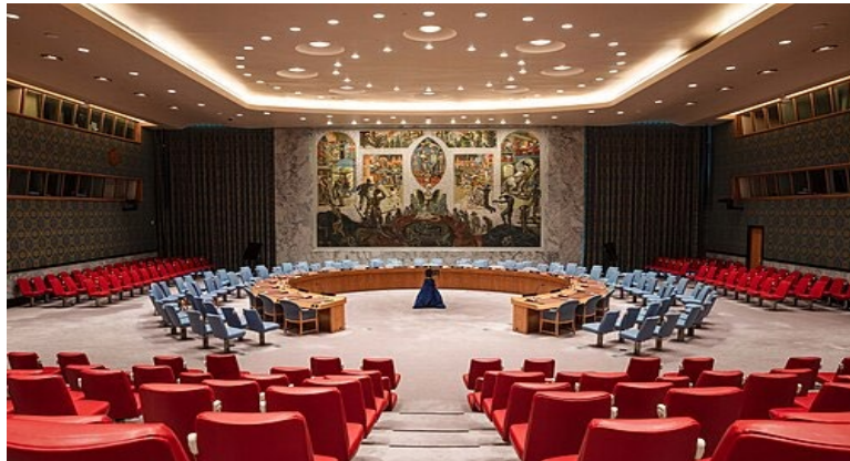
United Nations SECURITY COUNCIL Chamber Peace through Justice

So, after burning its fingers, China, too, learns its lesson, namely that it is better to act justly than to cling to mere paper ‘rights’.